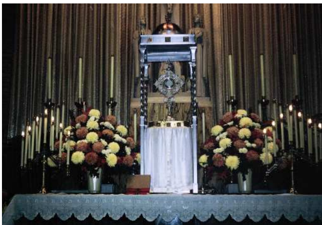
Traditional Forty Hours symbolized the parish's love for the Eucharist.