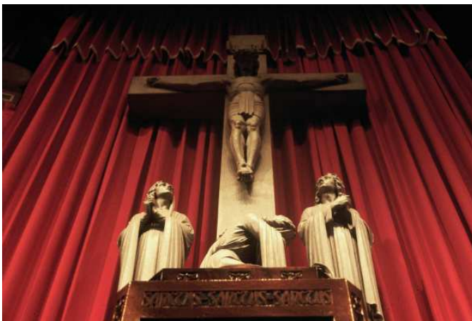
The stunning stone crucifixion scene towers over the brass tabernacle.