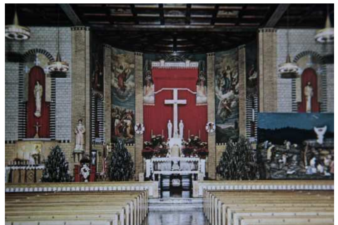
Christmas in the past featured a nearly life-sized Nativity scene (right).