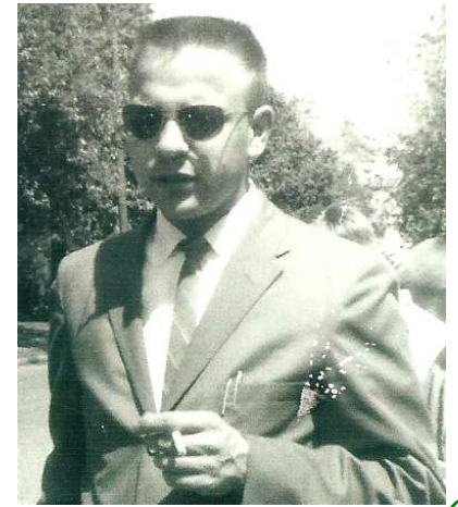
The nametag they made me wear!