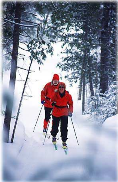
Only a fantasy right now!